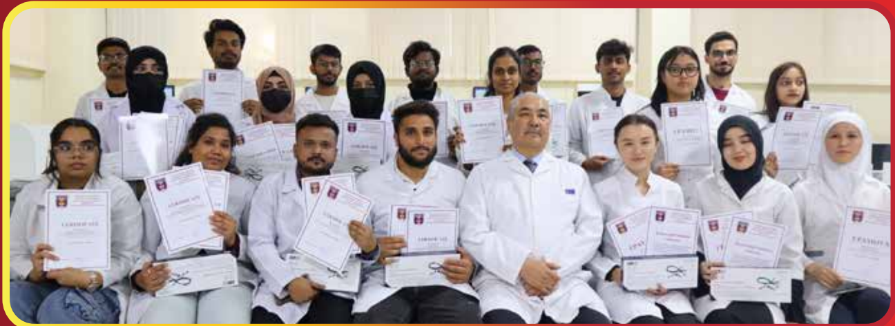
Rector with International Students

It is a true privilege to lead a medical university that is a definite excitement each day! I look forward to helping our students tell their own unique stories.”